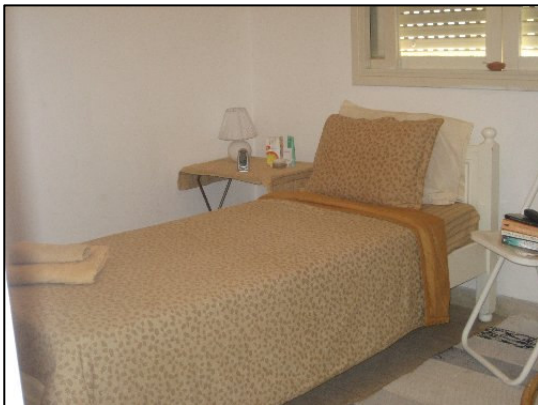
The single room

We are slowly equipping and refurbishing the Center building and guest rooms as funds become available. As a matter of priority we are targeting the library and study area and the guest rooms. Even at this early stage we have had a steady flow of guests staying in the guest rooms.