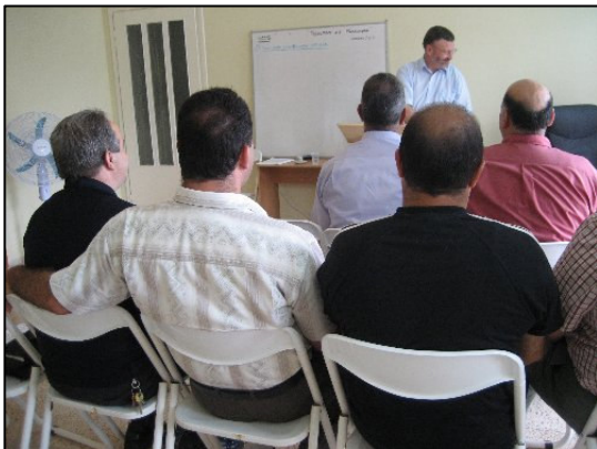
First class given in July 2006